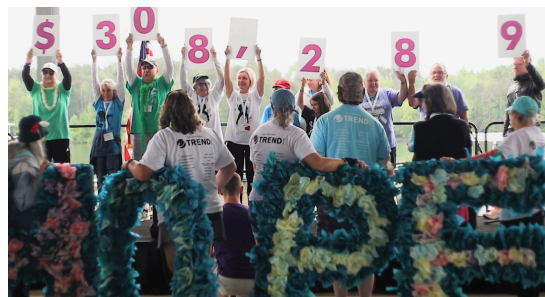
Number flip of amount raised at the 18th Annual Dragon Boat.

In 2024, two long-time community fundraising events made a significant impact on cancer care in the Upstate. The 18th annual Prisma Health Dragon Boat Upstate Festival, held at Portman Shoals Marina, brought together 22 teams of paddlers, donors, volunteers, and sponsors, raising over $300,000 to support cancer research and patient programs.