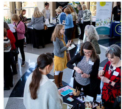
Inaugural "Day of the Woman" Conference participants enjoy the community partnership health fair between conference sessions.