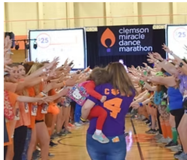
Clemson University's Dance Marathon

In 2024, the partnership between Prisma Health Children's Hospital-Upstate and Children's Miracle Network Hospitals (CMN) continued to make a significant impact on pediatric healthcare in our community. Through the ongoing support of national corporate partners—including Publix, Walmart & Sam's Club, Costco, and Great Clips—as well as the dedicated efforts of Clemson University's Dance Marathon, $1.15 million was raised. These funds are instrumental in enhancing vital pediatric programs, providing critical life-saving treatments, supporting innovative research, and offering financial assistance to families in need. By engaging local communities and businesses, CMN ensures that donations directly benefit local member hospitals, addressing the most urgent needs and helping to change children's health for a better future.