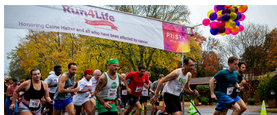
Starting line of the 16th Annual Run4Life 5K & Family Fun Run.

In November, the 16th annual Run4Life 5K and Family Fun Run welcomed more than 1,000 participants at the Caine Halter Family YMCA. Over $126,000 was raised to benefit programs at the Prisma Health Cancer Institute, providing vital support for patients and their families during treatment and recovery. These events not only generated critical funds but also inspired hope and resilience, uniting the community in the fight against cancer.