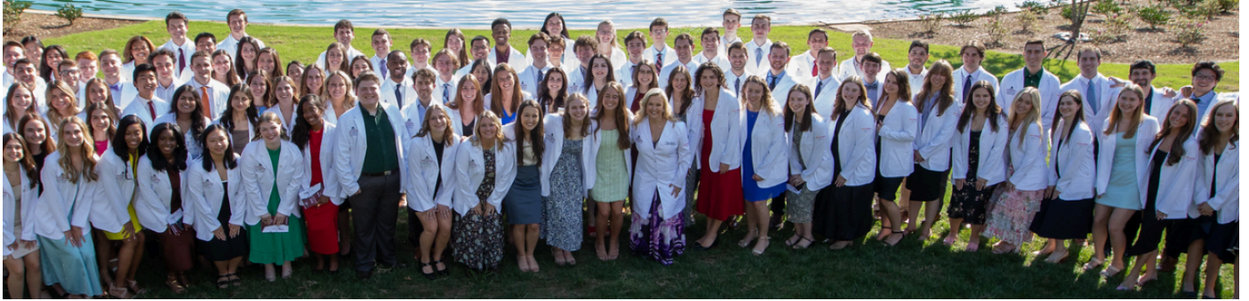
The University of South Carolina School of Medicine Greenville Class of 2024 at their White Coat Ceremony at Furman University.