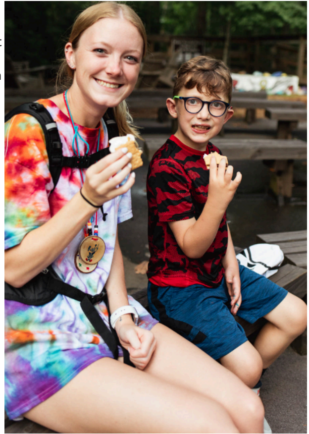
A camper and counselor at Camp Heart -to-Heart.

Beyond the fun, Camp Heart-to-Heart fosters confidence, resilience, and lasting friendships among these young campers. The support of the endowment ensures that this life-changing program will continue to enrich lives, empowering young hearts to embrace every moment with courage and joy.