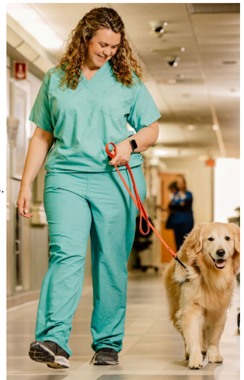
Bunny, a Prisma Health Canine F.E.T.C.H. facility dog is off to work bringing comfort to a patient.

The program’s success is sustained by endowments that cover the costs of training, veterinary care, food, and handler support, ensuring that these invaluable canine team members continue to make a “paw-sitive” impact on patient care. As the demand for facility dog services grows, these endowments play a crucial role in maintaining and expanding the F.E.T.C.H. Program, allowing it to reach more patients and provide therapeutic benefits throughout the hospital.