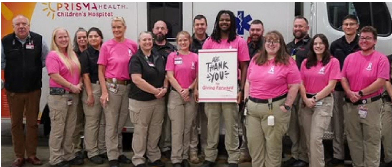
Prisma Health Ambulance Service - Greenville Division team raised $580 from their breast cancer awareness t-shirt sale for the Cancer Institute.

In 2024, Prisma Health team members demonstrated their commitment for making a difference through the annual Team Member Giving Campaign. Over two weeks, employees collectively raised over $30,000 to support Prisma Health-Upstate Foundation initiatives. This remarkable participation reflects the dedication of Prisma Health's team members to improving the lives of patients, families, and the broader community.